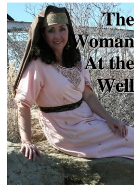
Living Water, the Holy Spirit